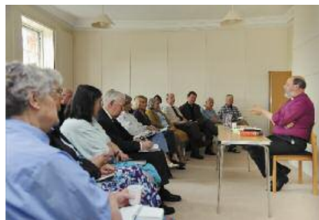
The Sarum Theological Lecture 2011 speaker was Tom Wright. In addition to the evening lectures, he gave a seminar on Paul in the College's Anderson room.

With the rise of asymmetric warfare, does the traditional understanding of just war theory work in the 21st century? Does human rights legislation have a place on the battlefield? And has secularisation undermined the moral substructure of the British army?