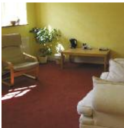
Baker suite, a premier room with sitting area

Bedroom prices vary. Standard rooms, which have a hand basin in the room and a shared bathroom nearby, are the cheapest. En-suite rooms are a bit more expensive and the seven premier rooms are top of the range: two have a separate sitting room (ideal for study breaks and other long-term stays) with cathedral views across the rooftops of the Close and the others are recently refurbished with breath-taking cathedral views.