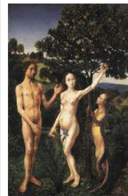
The Fall by Hugo van der Goes