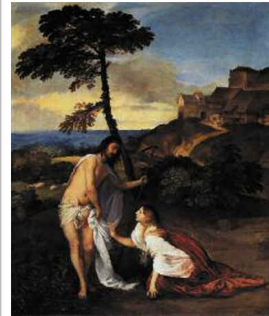
Noli Me Tangere by Titian

Price £45 including lunch and refreshments